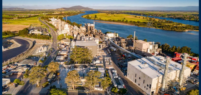
Aerial view of the Shoalhaven Starches site in Bomaderry, New South Wales

Mr Jones said incident reports confirmed all onsite health and safety equipment – including suppression system safety vents, steam quench and fire sprinklers – performed to industry standards. He said working with industry experts and local regulators to establish the cause and implementing all safety recommendations was the highest priority.